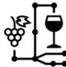
Supply Chains Management