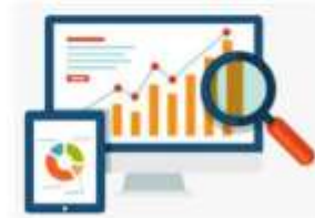
Analytic Data & Prediction