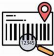
Tracking & Tracing